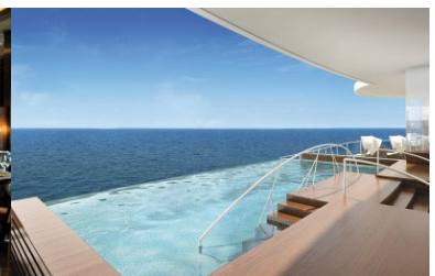
Infinity Pool 無邊際泳池