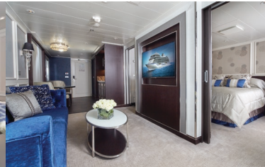
套房 Penthouse Suite (約 41.8 sq m)