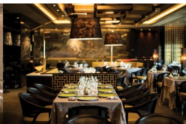
Pacific Rim 亞洲餐廳