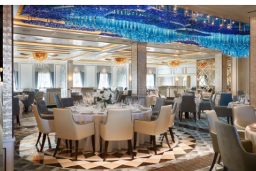
Compass Rose 船隊旗艦主餐廳