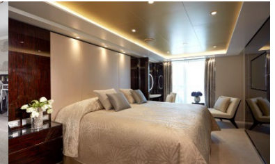
七海套房 Seven Seas Suite (約 53.6 – 60.8 sq m)

麗晶七海郵輪的精緻美饌亦一直享譽業界，其中船上的扒房 Prime 7 使用玻璃、金屬和花崗岩精心裝飾，在各方面都彰顯出經典格調，豪華品質。而旗艦主餐廳 Compass Rose 則在設計時頗為用心，採用精美的木材與淺色大理石和閃亮的珍珠母互相映襯，配以藍色、白色、金色和銀色的燈光色彩，顯得極為雅致。配合船上的精選佳釀，勢必滿足您對美食的完美追求。加上 Pacific Rim 為客人提供了亞洲菜式，令船上的餐膳選擇更趨多元化以滿足你對不同地方美食的追求。