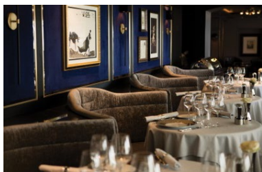
Prime 7 美式扒房

麗晶七海郵輪的精緻美饌亦一直享譽業界，其中船上的扒房 Prime 7 使用玻璃、金屬和花崗岩精心裝飾，在各方面都彰顯出經典格調，豪華品質。而旗艦主餐廳 Compass Rose 則在設計時頗為用心，採用精美的木材與淺色大理石和閃亮的珍珠母互相映襯，配以藍色、白色、金色和銀色的燈光色彩，顯得極為雅致。配合船上的精選佳釀，勢必滿足您對美食的完美追求。加上 Pacific Rim 為客人提供了亞洲菜式，令船上的餐膳選擇更趨多元化以滿足你對不同地方美食的追求。