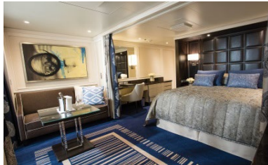
露台套房 Deluxe Veranda Suite (約 23.5 sq m)

七海探索者號 Seven Seas Explorer 是麗晶七海郵輪於 2016 年 7 月正式下水服役的頂級郵輪。這艘船對麗晶七海郵輪而言具有相當特別的意義，因為這是其打算用來重新定義頂級郵輪體驗的代表作，亦被稱為「有史以來造價最昂貴的一艘頂級郵輪」THE MOST LUXURIOUS SHIP EVER BUILT™。麗晶七海郵輪完美結合了寧靜與繁華，為乘客提供了高雅奢華的全包式航遊體驗、舒適寬敞的船上空間、97% 艙房設有私人露台、貼心細緻的服務及船上各類高檔設施皆是讓七海郵輪廣受業界好評的原因，而當中套房級 Penthouse Suite 以上更提供專業管家服務！