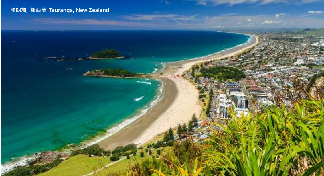
陶朗加, 紐西蘭 Tauranga, New Zealand