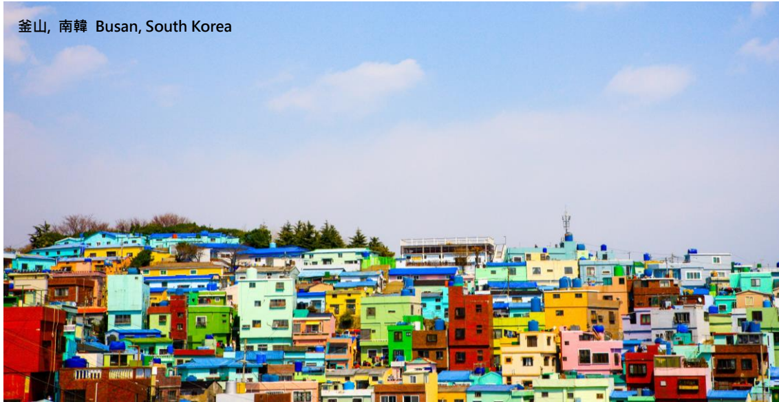
釜山, 南韓 Busan, South Korea