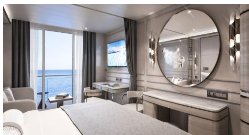
Deluxe Suite with Verandah (28.3m2 / 304 ft2)