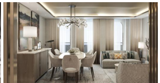
Owner's Suite with Verandah (105 m2 / 1,130 ft2)