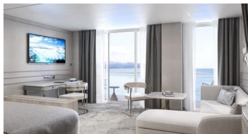
Penthouse Suite with Verandah (42.5 m2 / 457 ft2)