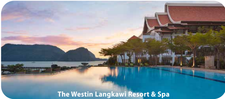
The Westin Langkawi Resort & Spa

G Hotel Gurney https://gurney.ghotel.com.my/