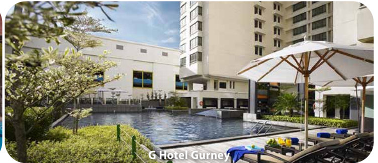
G Hotel Gurney