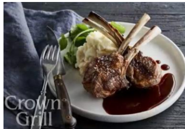
Crown Grill · 曾被評為最佳遊輪牛排館