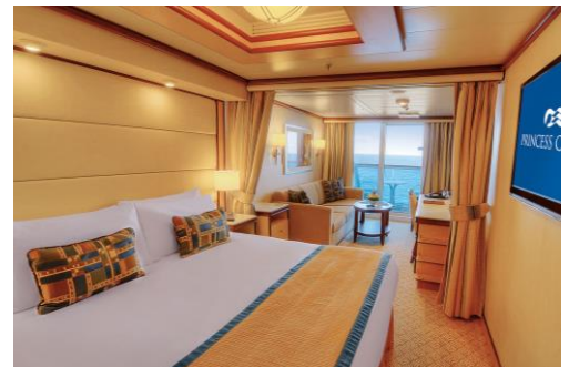
迷你套房 Mini Suite