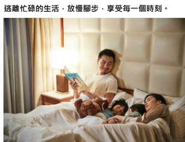
提供一個家以外的舒適環境，Princess Luxury Bed