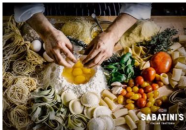
Sabatini's Italian Trattoria, 船上經典意式餐廳