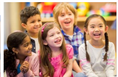
Reimagined youth & Teen Clubs 啟發小童對未知事物的興趣