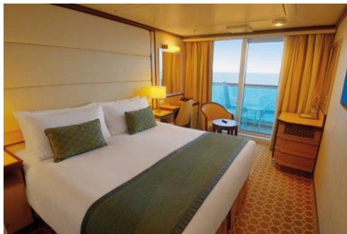
露台房 Balcony Suite

星空公主號 為 Royal Class 系列第四艘旗艦郵輪，船身設計和內部裝潢不僅延續了前 Royal Class 郵輪的成功經驗，還進行了改良和升級，星空公主號汲取了公主郵輪享譽全球的標誌性元素和無與倫比的賓客體驗，並集合姐妹郵輪上的亮點設施和產品於一體。當中包括一些休閒設施及特色餐廳等..... 將於 2019 年 10 月正式下水，為旅客帶來獨特的地中海郵輪新體驗。