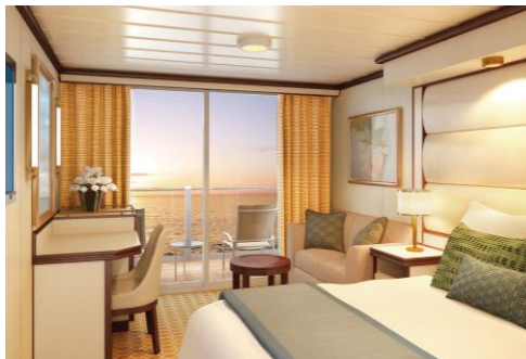
尊貴露台房 Deluxe Balcony Suite